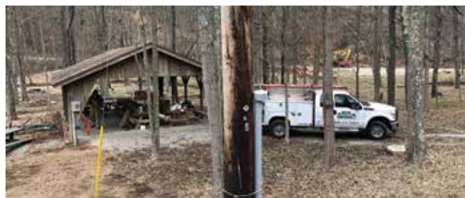
HARD AT WORK: REA Energy Services employees install electricity to Blackleggs Memorial Park.

Just in time for the 2018 fishing season, an exciting new enhancement to the park will greet eager anglers and school children. Recently the cooperative’s subsidiary, REA Energy