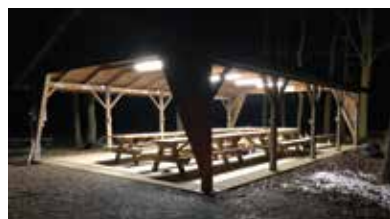
SHINING BRIGHT: Visitors to the park can now enjoy lights after dark.

In August 2009, Blackleggs Creek Memorial Park was officially dedicated to past and present members of the association. A pavilion was built for the use of the countless people who have enjoyed the first day of trout season along the creek. Other events throughout the years have been held at the park, including several “Trout in the Classroom” events for area schoolchildren.