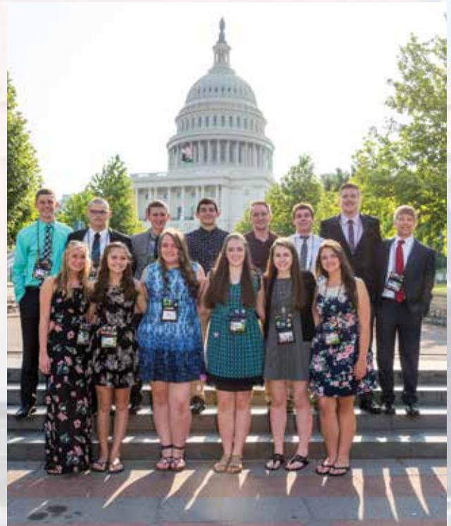
YOUTH TOUR CAPITOL: REA Energy Youth Tour 2017 representatives pause for a photo in front of the Capitol Building.

Eleanor Roosevelt once said, "The purpose of life, after all, is to live it, to